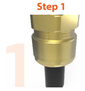
Follow cable gland installation instructions until final stage – tightening of rear seal

The gland is permanently marked with various lines/numbers indicating the correct tightening level related to the cable diameter. Following the relevant cable gland Installation Instructions, the back seal should be tightened until a seal is formed on the cable outer sheath and then tightened one further turn.