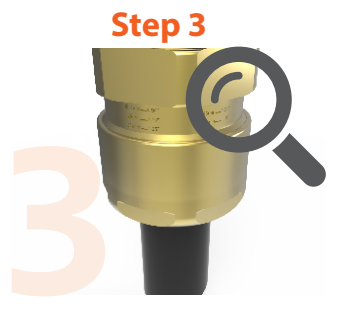
The backnut should be level with the marking guide corresponding to its diameter – this can be visually inspected and adjusted as necessary

Note: The cable gland installation instructions have a printed cable OD measure for if the cable OD is not known