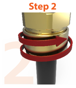
Tighten backnut until a seal is formed onto the cable, then tighten one further turn